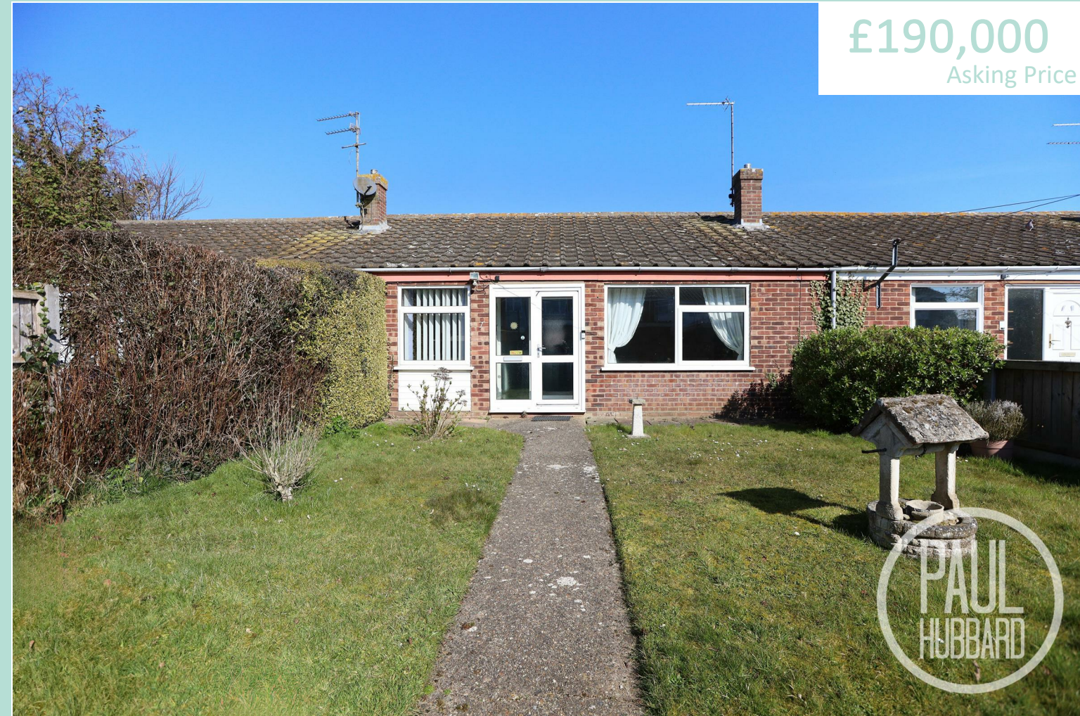
LLOYDS AVENUE 689 sq.ft. (64.0 sq.m.) approx.